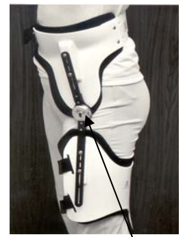
Fig. 6. Incorrect position (too far forward)